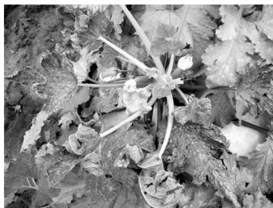
Fig. 1. Cucurbit leaf crumple virus symptoms recorded on zucchini squash plants in Citra, FL (2006), with severe Silverleaf symptoms in the background.

In related studies reflective mulch alone has successfully delayed and decreased the spread of viruses transmitted by various insect pests (Reitz et al. 2003; Stapleton & Summers 2002; Summers et al. 2004). Alternatively, living mulch has also been reported to reduce whitefly and aphid numbers and the incidence of insect-borne viruses in zucchini squash and tomatoes, respectively (Hooks et al. 1998; Hilje & Stansly 2008). When